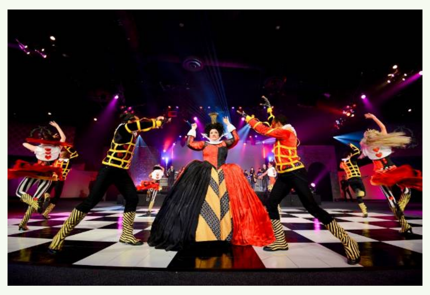
The Queen of Hearts takes center stage at Club Evil Live.

The female villains of Disney films are some of the most fascinating characters around, with their sneaky wit and sultry style. Club Evil Live, a unique event offering produced by the Florida-based Creative Entertainment Disney Event Group (DEG), brings these evil ladies to life for corporate and private groups.