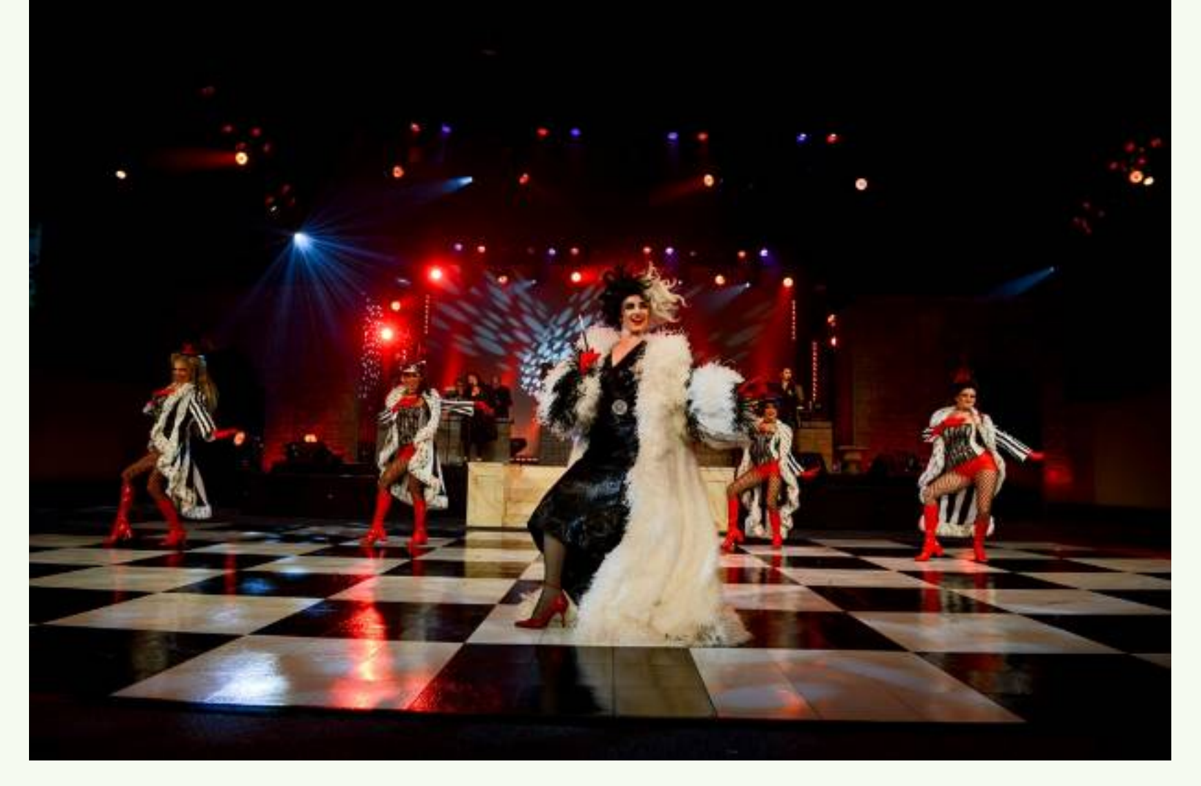
Cruella de Vil's infamous style has inspired her dancers' costumes.

The team at DEG is working on further evolutions of the event to include other villains and a new name to encompass the villains, their vanity and their vendettas: "V."